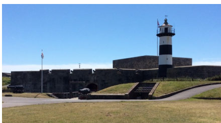
Southsea Castle and lighthouse.